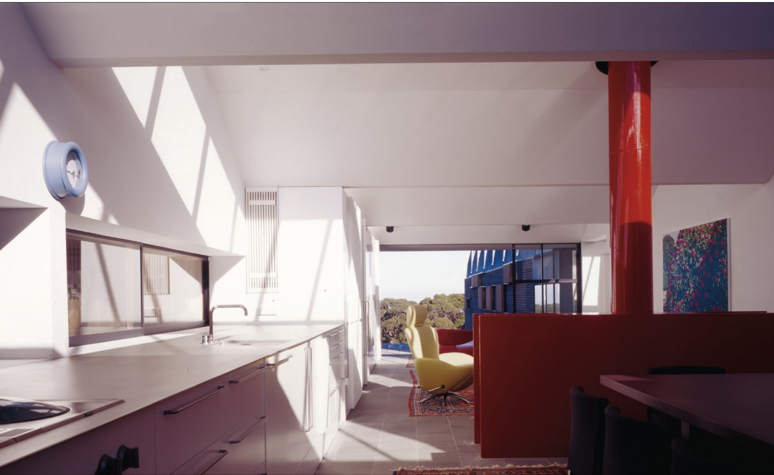
Just you and the Kangaroos...